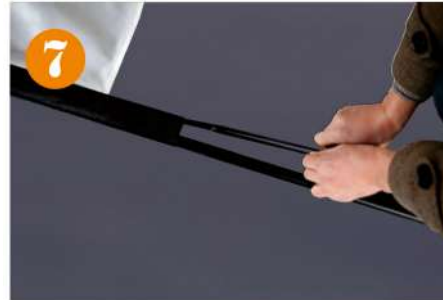
7. Place the bungee cord through the flag hole at the bottom of the sleeve.