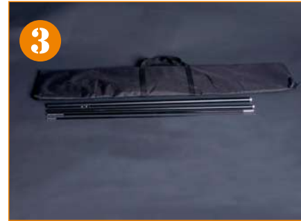
3. Take out the poles