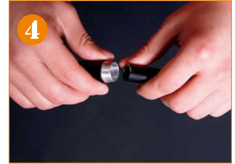
4. Connect the poles one by one