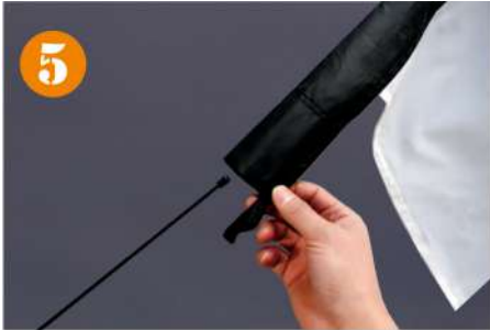
5. Feed the pole into the graphic