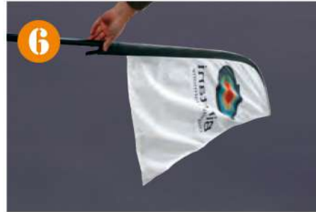
6. When the pole is fully inserted, it should look like this