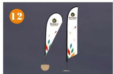
12. This is what the flags should look like when it is complete.