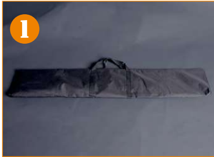
1. Bag with stand